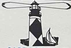
CAPE LOOKOUT LIGHT HOUSE